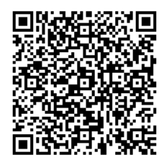
Or view our pricelist (at the showroom entrance)