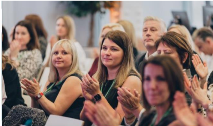
Motus Employees at the Automotive 30% conference